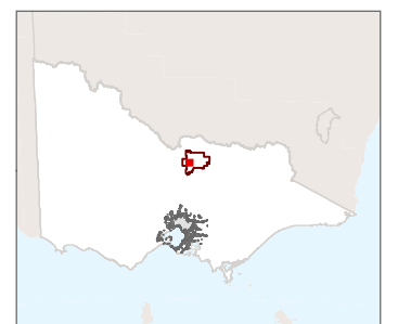
Part of Planning Scheme Maps 6, 7, 8 & 10

Disclaimer This publication may be of assistance to you but the State of Victoria and its employees do not guarantee that the publication is without flaw of any kind or is wholly appropriate for your particular purposes and therefore disclaims all liability for any error, loss or other consequence which may arise from you relying on any information in this publication.