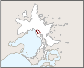
Part of Planning Scheme Map 2DDO

Disclaimer This publication may be of assistance to you but the State of Victoria and its employees do not guarantee that the publication is without flaw of any kind or is wholly appropriate for your particular purposes and therefore disclaims all liability for any error, loss or other consequence which may arise from you relying on any information in this publication. © The State of Victoria Department of Environment, Land, Water and Planning 2022